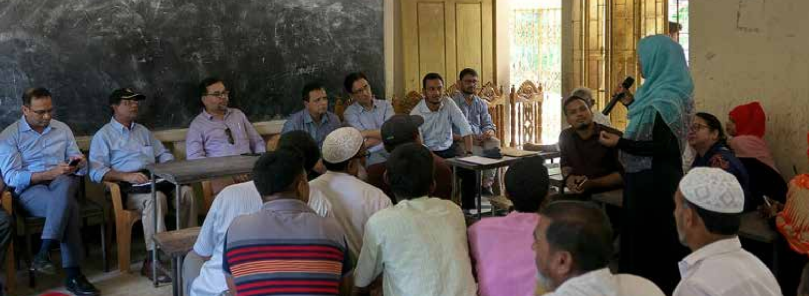
Mission's field visit to Cox's Bazar and Chattogram from the 29-30 April 2019