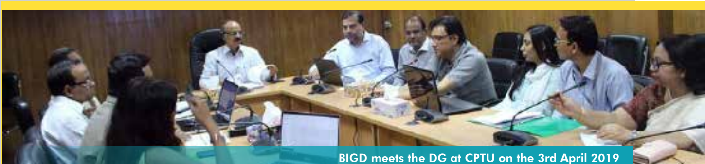
BIGD meets the DG at CPTU on the 3rd April 2019

The review team members visited the citizen engagement activities at Chakoria upazila of Cox's Bazar and Lohagara upazila of Chattogram districts. The team noted with satisfaction that the citizens were actively engaged in the monitoring activities of the construction works. But few suggestions were made, for example, the need for BIGD to develop a check-list in Bangla on the do's and don'ts for the citizen groups in some categories like construction of schools, rural roads, and embankments. BIGD is expected to coordinate and share information with Dnet to be disseminated through the citizen portal.