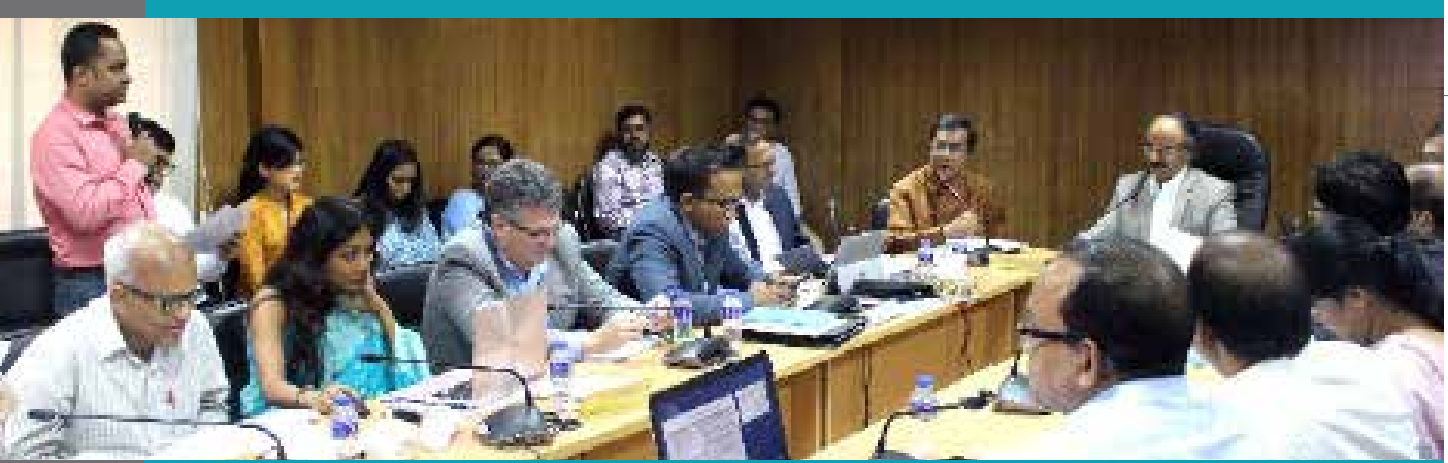
BIGD participated in the 4 th World Bank Support Mission held between 28 April to 6 May 2019

citizens' monitoring and national level dialogue under the platform of Public-Private Stakeholders Committee (PPSC). BIGD has successfully started site-specific citizen monitoring in 16 of the planned 48 sub-districts covering 8 divisions from April 2019. BIGD has partnered with BRAC Community Empowerment Program (CEP) to implement the sub-component. BIGD and BRAC CEP program appointed 8 Field