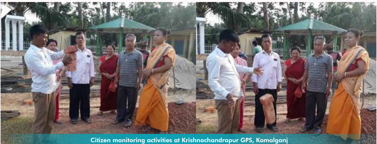
Citizen monitoring activities at Krishnochandrapur GPS, Kamalganj

On 16 th April 2019, a group member complained that the brick used in the construction of Krishnochandra Government primary School in Kamalganj, MoulaviBazar were not of 1 st grade quality, which he had found out after testing the brick in the same way he was trained to during orientation by the field officials. Later when more members of the citizen group united at the site, a member demonstrated the test he had done earlier, which further confirmed his statement that the brick was not of good quality. The next day a complaint was made at the LGED office and on 25 th April when the Upazila sub-assistant engineer was contacted for follow up, he informed them that from next onwards only the best quality of brick will be acceptable.