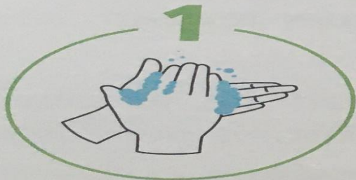
Palm to palm