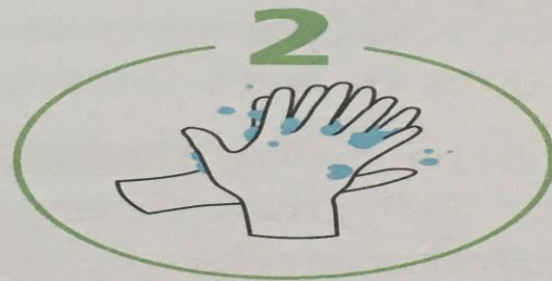
The backs of hands