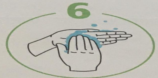
The tips of the fingers