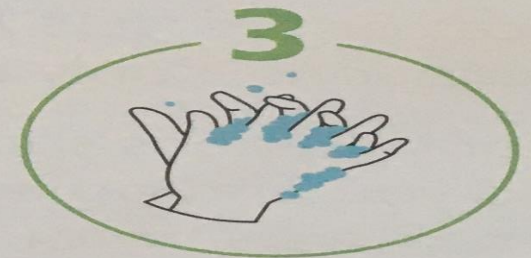
In between the fingers