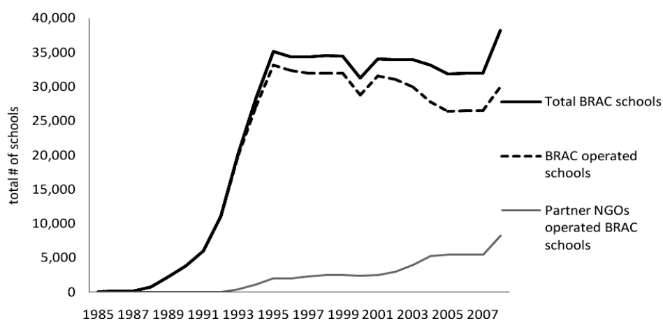
Appendix Figure 1. Trends in the number of BRAC primary schools, 1985-2008

Source: BRAC Education Program (BEP) database.