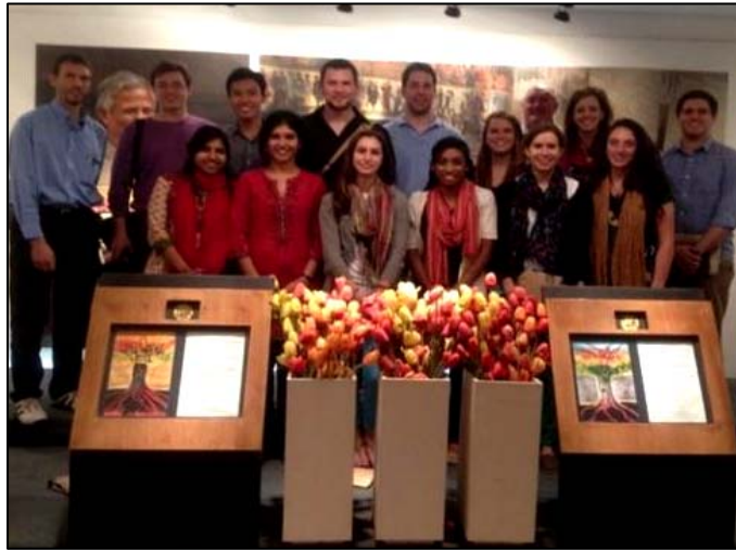
The group of visiting students from University of Virginia, USA

Institute of Governance Studies (IGS) facilitated a study tour of a course titled "Development Practices: Social Enterprise in