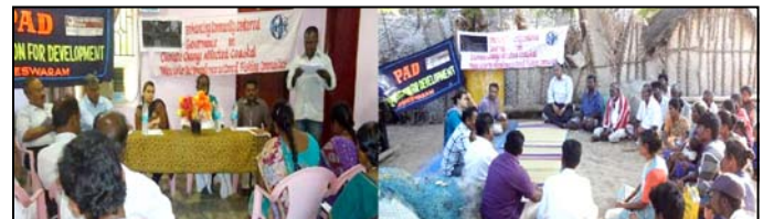
ANSA-SAR Team conducting meeting with representatives from

develop democratic practices in urban local governance institutions through social accountability for the improvement of basic services. It focuses on enhancing organised