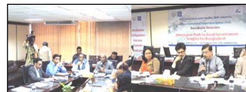
Some of the Participants in the Roundtable

Although the concept of ‘good governance’ has emerged with a genuine appeal, the advocated paths to achieve it have come under increased scrutiny and criticism in recent times. Alongside the “good-enough” governance discourse, there is a growing voice whether it is time to explore any “alternative path” to attain good governance. To attempt to answer some of these queries and to suggest policy options, the Institute of Governance Studies (IGS), BRAC University, in collaboration with Japan International Cooperation Agency (JICA), organised a roundtable discussion entitled