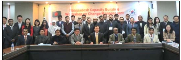
Participants at the closing ceremony of the workshop arranged for MAGD Batch IV students in KDI School, Seoul

Students of MA in Governance and Development Programme (MAGD), Batch IV, visited Korean Development Institute (KDI) School of Public Policy and Management in Seoul, Korea from 4-9 March, 2013. During the visit, the students participated in "Bangladesh Capacity Building Workshop on Change