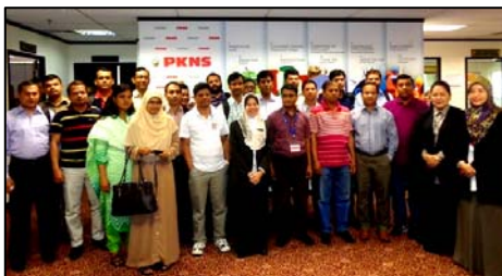
Participants at the workshop arranged for MAGD Batch IV students in IPD-OUM, Malaysia

"Public Management" for one week in the Institute of Professional Development of Open University Malaysia (IPD-OUM). Students were taught different issues on good