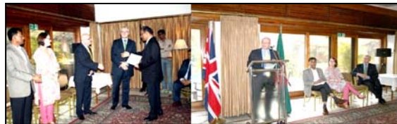
CIPS students receiving their certificates from the British High Commissioner at the ceremony

On 12th February, 2013 CIPS Cohort-2 Certificate Award Ceremony took place at the British High Commission, Dhaka. Public