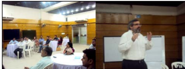
Participants at the workshop on Cultivating Critical Thinking and Experiential Learning in Teaching Process

Teaching and Learning Centre (TLC), BRAC University, organised a two-day long workshop titled Cultivating Critical Thinking and Experiential Learning in Teaching Process on 21 March 2013, at the BRAC University Auditorium. The workshop was offered to the nominated faculty members from each