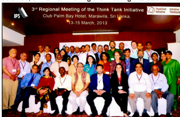
3 rd Regional Meeting of the IDRC Think Tank Initiative at Colombo