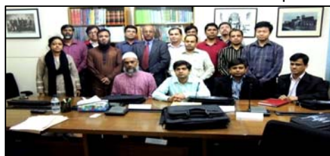
Participants at the Training Programme

A training programme on 'Strategic Sourcing' was organised by IGS on 15-17 February 2013, at the Institute's Conference Room. As part of core activities of IGS, this training course was offered to enhance the capacity of the Supply Chain professionals. The Strategic Sourcing course was attended by 14 participants from different organisations such as Bashundhara Group, Square Hospital, Alliance Holdings Limited, Marie Stopes, Robi Axiata Limited, etc.