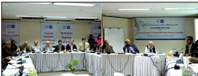
Participants exchanging their views at the Roundtable