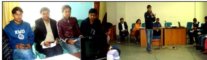
ANSA-SAR Team at the mobile-based e-Governance system Training Workshop.

ANSA SAR and its partner PRIP Trust jointly organised a technical training workshop for the mobile-based application on Citizen Feedback from 26 to 28 January, 2013 in Rajshahi to implement the "ICT Based Citizens' Monitoring" project. This initiative was taken in order to introduce a mobile