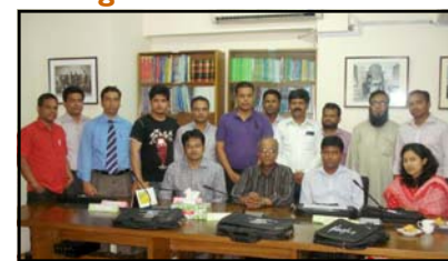
Participants at the Training Programme on PPM- Batch 3