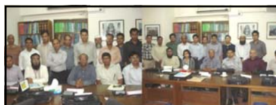
Participants from PPM Batch-1 and PPM Batch-2 Attended the Training Programme

A training programme, titled Procurement Principles and Management was organised by IGS, BRAC University, at IGS Conference Room. There were two batches in this training programme. PPM Batch-1 was held on 05-06 April and PPM Batch-2 was held on 19-20 April, 2013. The training was attended by 14 participants for each batch from