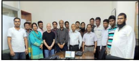
Participants with the IGS Director at the Training Programme on Strategic Procurement at IGS