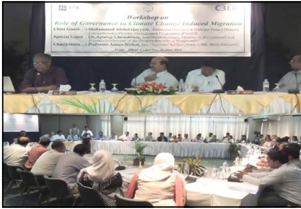
Panel discussants and the participants at the Workshop on Climate Change Induced Migration

(C3ER) of BRAC University has successfully completed a research on “Role of Governance in Climate Change Induced Migration.” The overall objective of the research