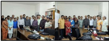
Participants at the Training Programme on Best Procurement Practices Batch 1 (left) and Batch 2 (Right)

On 7 th and 8 th June, 2013 IGS, BRAC University organised a training programme on Best Procurement Practices (Batch -1) at the IGS Conference room. As part of the core