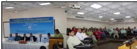
Participants and the Panel of Guests at the Certificate Awarding Ceremony

The new recruited members of the IGS research team took part in an Executive Certificate Course on "Governance and Development" at North South University from 5 -18 April 2013. This certificate course