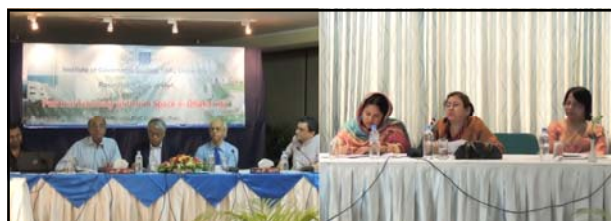
Participants at the Roundtable Discussion on the Political Economy of Urban Space in Dhaka City