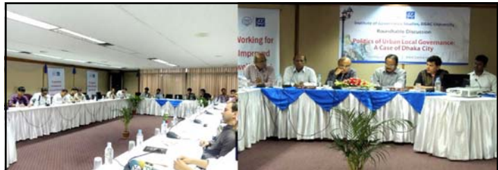
Participants and the Panel Discussants at the roundtable discussion on Politics on Urban Local Governance

The Institute of Governance Studies (IGS) organised a roundtable discussion titled “Politics of Urban Local Governance: A Case of Dhaka City” on June 27, 2013 at BRAC Centre Inn Conference Room, Dhaka. The roundtable is being organised as a follow-up event of the research report titled “ STATE OF CITIES: Urban Governance in Dhaka”