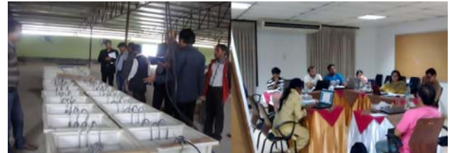
Participants of Environmental Management and Governance Course during field visit at the Eco-Lab Battery Ltd