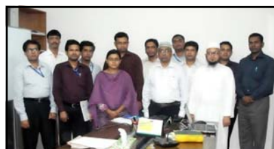
Participants at the Training Programme on Income Tax and VAT

IGS organised a two-day training programme on Income Tax and