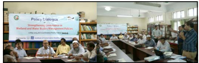
Participants at the policy dialogue on ‘Strengthening Governance in Wetland and Water bodies Management Policies’

IGS organised a day long policy dialogue titled “Strengthening Governance in Wetland and Water Bodies Management Policies” on 11 th May 2013, at the Conference Hall of Pabna DC Office. The dialogue was organised with the technical cooperation of Wetland Biodiversity Rehabilitation Project (WBRP) partners GOPA and Centre for Natural Resources Studies (CNRS). More than 31 participants from different GO/NGO stakeholders, fishermen cooperatives, fish traders and media personnel participated in this dialogue. The district level policy dialogue included brainstorming and group discussion sessions which were