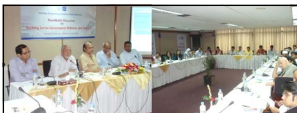
Participants at the Roundtable on Banking Sector Governance

The Institute of Governance Studies (IGS) organised its second roundtable discussions on topic covered in its flagship report – The State of Governance (SOG) in Bangladesh 2010-11.