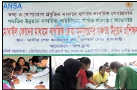
Training on ICT Based Monitoring services

From 16-27 April, 2013 ANSA-SAR & PRIP Trust organised a Mobile Phone based Skill Training in Urban and Rural Level for the citizens who are getting public services. In the training the citizens were taught how to evaluate the services of public services through mobile software. This training was a part of the project called " Improvement of Quality and Delivery Mechanism of Public Services through ICT based Citizens' Monitoring Initiatives " in Rajshahi. Each of