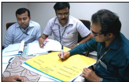
Participants during a group work at the workshop on Requisition, Specification and Essentials of Procurement

A workshop on Requisition, Specification and Essentials of Procurement was held at the BRAC Centre Inn on 7 th November, 2013. A total of 30 participants from different departments of BRAC, those who are involved with procurement participated in this workshop. The workshop was