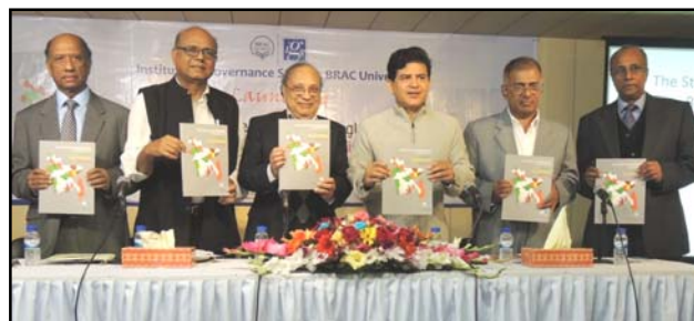
Distinguished guests holding the copies of IGS annual flagship research report The State of Governance in Bangladesh 2012 at the launching