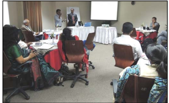
Participants at the Second Policy Analysis Workshop at BRAC Centre Inn

The workshop aimed to make a more thoughtful, effective, and equitable participation in policy analysis work, especially in the making of choices about action. The workshop sought to achieve this goal by giving participants more understanding of techniques/tools and of processes, including concepts, theories, frameworks, more skills in using all these and in contributing as a policy player. More importantly, the workshop was organised to help participants design a curriculum and develop a course about preparing, designing, selecting and analysing 'public policy'. It