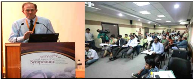
A breakout session at the Urban Health Symposium: Taking Action for Healthy Cities

A two-day symposium on Urban Health: Taking Actions for Healthy Cities in Bangladesh was held on 22-23rd November 2013 at PKSF Auditorium, Agargaon, Dhaka. The event was organised in collaboration with the Centre for Urban Equity and Health, JPGSPH, BRAC University, Eminence Associates for Social Development, Bangladesh Urban Health Network