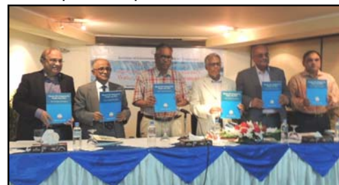
Distinguished Guests hold copies of the Human Development Report 2013: 'Water for Human Development' at the launching ceremony

IGS organised the launching ceremony of the Human Development Report 2013 titled 'Water for Human Development', published by Pakistan-based renowned Mahbub ul Haq Human Development Centre. The Launching Ceremony was held on 21 October 2013, at the BRAC Centre Inn Auditorium in Dhaka. This was for the first time in Bangladesh that any Bangladeshi institute published Mahbub-ul Huq Centre's Human Development Report.