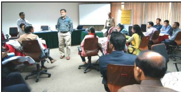
Participants and the trainers at the BPGIP training Course at BRAC Centre

A three-day long Exhaustive Training Course on BRAC Procurement Guideline and Implementation Procedure