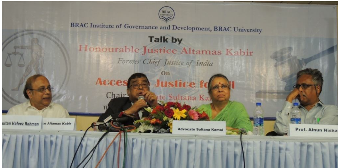
Justice Altamas Kabir, former Chief Justice of India, during the Q/A session of the Talk organised by BIGD, BRAC University

The immediate-past Chief Justice of India, Honorable Justice Altamas Kabir, believes that access to justice for all in countries like India and Bangladesh can be improved through various innovative alternative dispute resolution mechanisms. Justice Kabir was speaking at a Talk on 'Access to Justice for All', organised by BRAC Institute of Governance and Development (BIGD), BRAC University at the Daily Star Centre in the city on 24 April 2014.